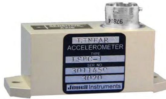
Outline Drawing: Dimensional Drawing for the LSB Accelerometer

The Jewell LSB Series Accelerometer is a general purpose \pm 0.5G to \pm 20G device designed for rail, commercial, and aerospace sensing requirements.